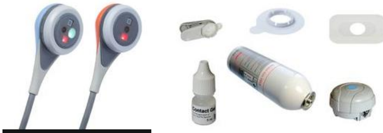
Figure 1 – A sampling of transcutaneous monitoring equipment, sensors, and application devices. (SenTec AG, Ringstrasse 39, CH-4106 Therwil, Switzerland, www.sentec.ch )